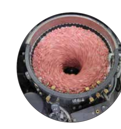
High Energy Deburring