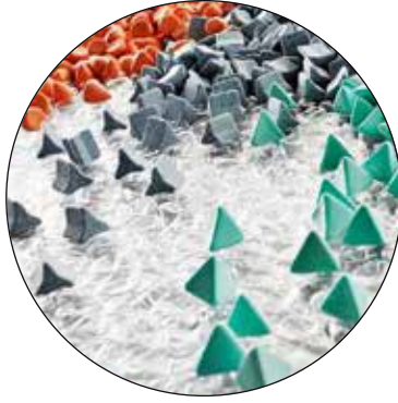
Ceramic - Plastic - Steel Media