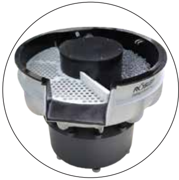
Rotary Vibratory Deburring