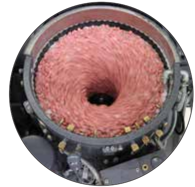
High Energy Deburring